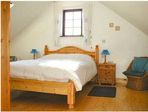
King Size bed