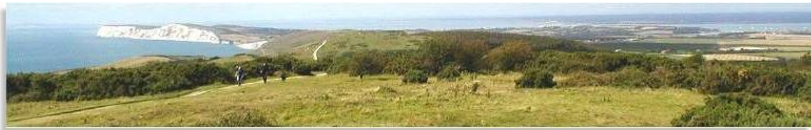
View from downs above Brighstone easy walking distance from holiday cottage

Link to Local Isle of Wight Public Houses and Restaurant and those recommended